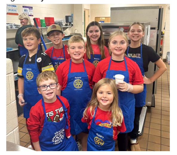
Meet our "Rotarians in Training!"

The Zelienople Club had a busy November. First, we toured the brand new Zelienople location for our local fire station. We held a pancake breakfast fundraiser to benefit the Hope Squad, a suicide prevention program at the Seneca Valley School District. We also: collected socks for the New Castle City Mission; ran a Lottery Calendar fundraiser; hosted a District Governor Official Visit Dinner for the Rotary Clubs of Ellwood City, New Castle and New Wilmington; and, hosted the annual Christmas Tree Lighting in conjunction with Small Business Saturday in Zelienople.